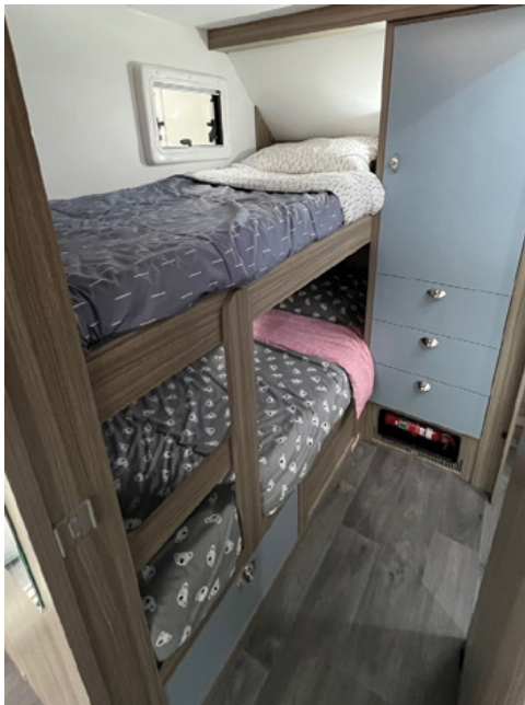
Waratah 6249 Interior