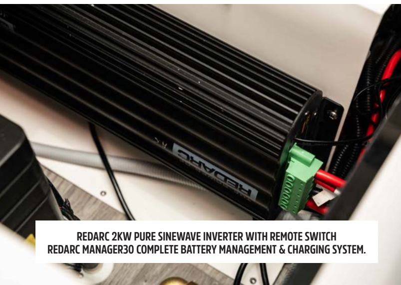
REDARC 2KW PURE SINEWAVE INVERTER WITH REMOTE SWITCH REDARC MANAGER30 COMPLETE BATTERY MANAGEMENT & CHARGING SYSTEM.