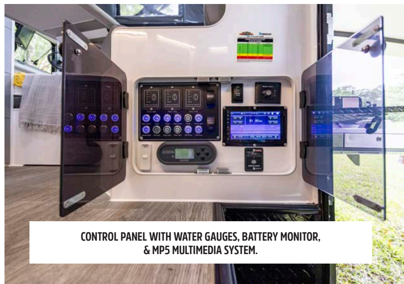
CONTROL PANEL WITH WATER GAUGES, BATTERY MONITOR, & MP5 MULTIMEDIA SYSTEM.