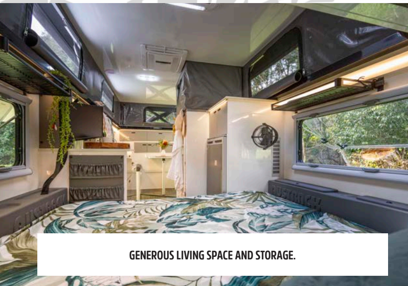
GENEROUS LIVING SPACE AND STORAGE.