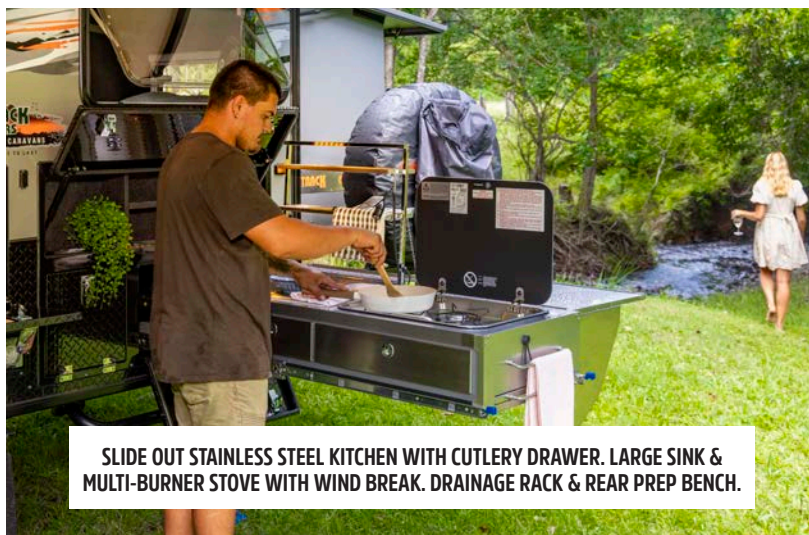
SLIDE OUT STAINLESS STEEL KITCHEN WITH CUTLERY DRAWER. LARGE SINK & MULTI-BURNER STOVE WITH WIND BREAK. DRAINAGE RACK & REAR PREP BENCH.