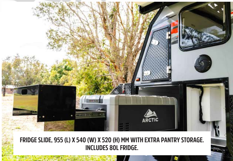
FRIDGE SLIDE, 955 (L) X 540 (W) X 520 (H) MM WITH EXTRA PANTRY STORAGE. INCLUDES 80L FRIDGE.