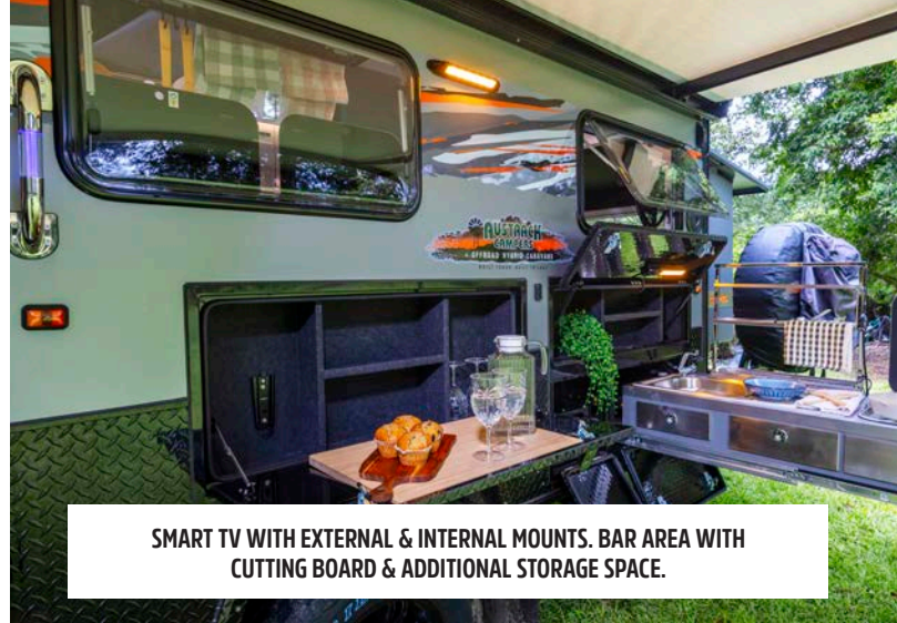
SMART TV WITH EXTERNAL & INTERNAL MOUNTS. BAR AREA WITH CUTTING BOARD & ADDITIONAL STORAGE SPACE.