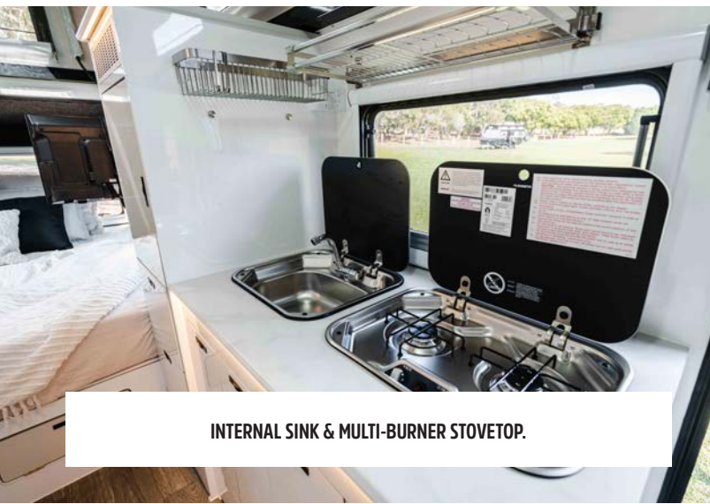
INTERNAL SINK & MULTI-BURNER STOVETOP.