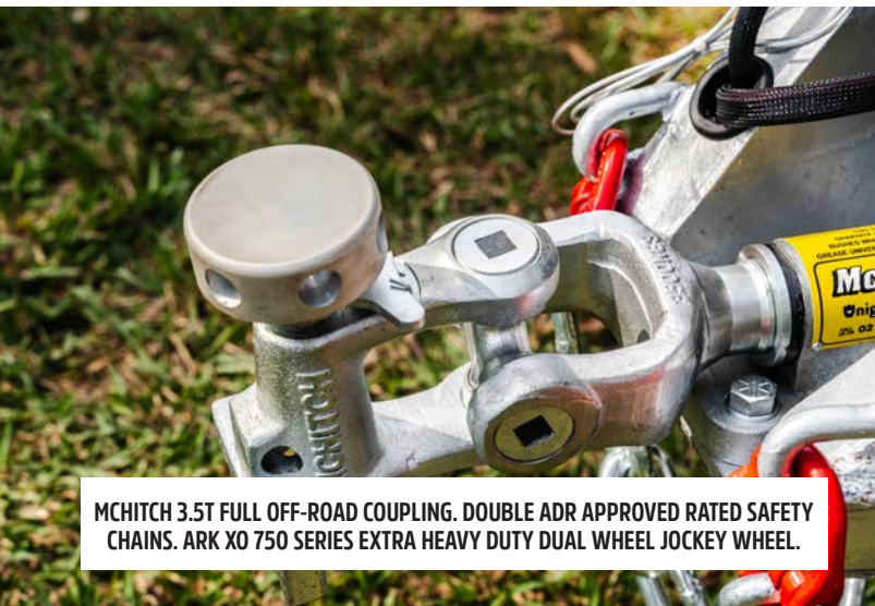
MCHITCH 3.5T FULL OFF-ROAD COUPLING. DOUBLE ADR APPROVED RATED SAFETY CHAINS. ARK XO 750 SERIES EXTRA HEAVY DUTY DUAL WHEEL JOCKEY WHEEL.