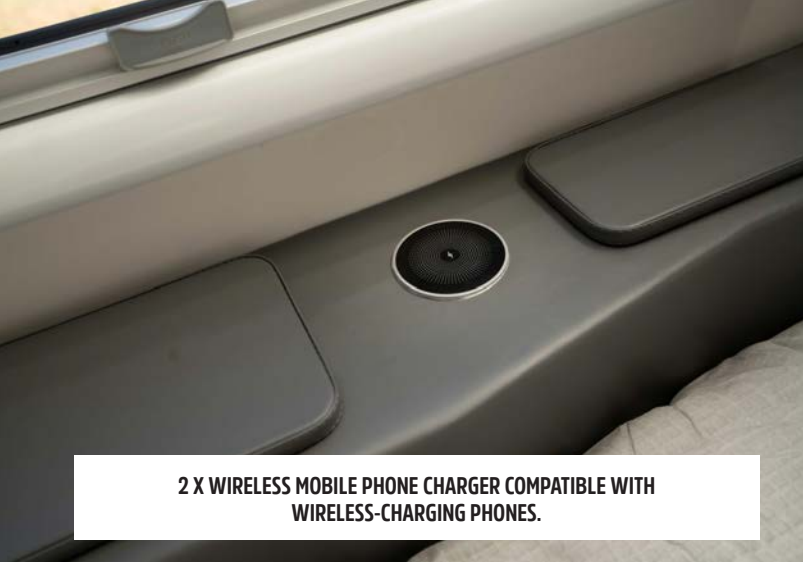
2 X WIRELESS MOBILE PHONE CHARGER COMPATIBLE WITH WIRELESS-CHARGING PHONES.