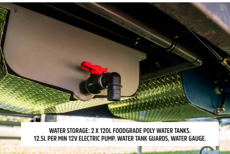
WATER STORAGE: 2 X 120L FOODGRADE POLY WATER TANKS. 12.5L PER MIN 12V ELECTRIC PUMP. WATER TANK GUARDS, WATER GAUGE.