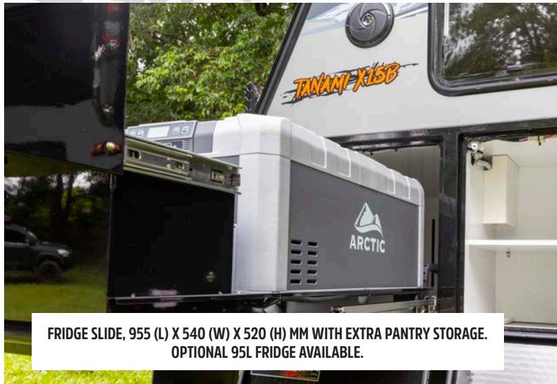
FRIDGE SLIDE, 955 (L) X 540 (W) X 520 (H) MM WITH EXTRA PANTRY STORAGE. OPTIONAL 95L FRIDGE AVAILABLE.