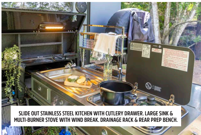
SLIDE OUT STAINLESS STEEL KITCHEN WITH CUTLERY DRAWER. LARGE SINK & MULTI-BURNER STOVE WITH WIND BREAK. DRAINAGE RACK & REAR PREP BENCH.