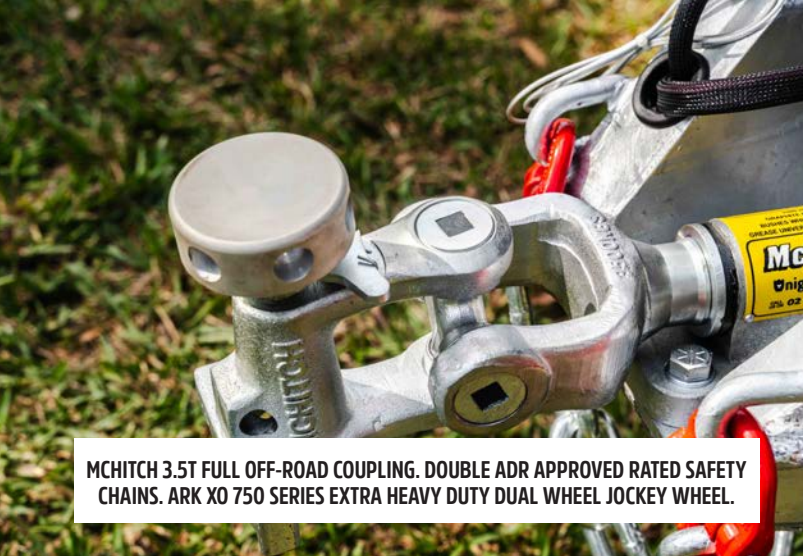
MCHITCH 3.5T FULL OFF-ROAD COUPLING. DOUBLE ADR APPROVED RATED SAFETY CHAINS. ARK XO 750 SERIES EXTRA HEAVY DUTY DUAL WHEEL JOCKEY WHEEL.