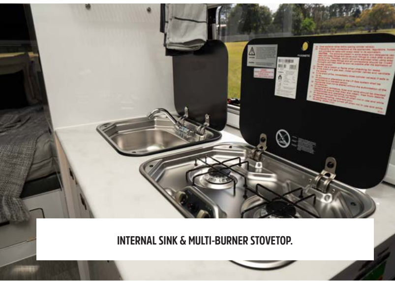
INTERNAL SINK & MULTI-BURNER STOVETOP.