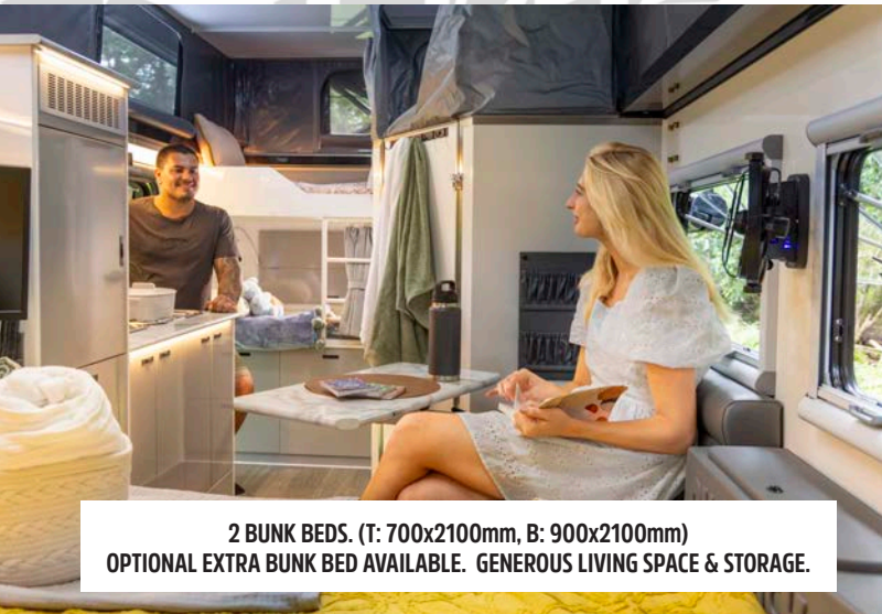
2 BUNK BEDS. (T: 700x2100mm, B: 900x2100mm) OPTIONAL EXTRA BUNK BED AVAILABLE. GENEROUS LIVING SPACE & STORAGE.