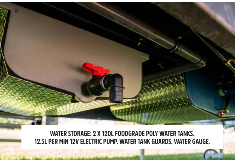
WATER STORAGE: 2 X 120L FOODGRADE POLY WATER TANKS. 12.5L PER MIN 12V ELECTRIC PUMP. WATER TANK GUARDS, WATER GAUGE.