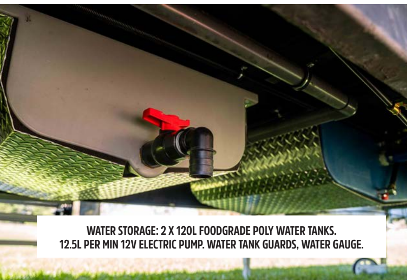
WATER STORAGE: 2 X 120L FOODGRADE POLY WATER TANKS. 12.5L PER MIN 12V ELECTRIC PUMP. WATER TANK GUARDS, WATER GAUGE.