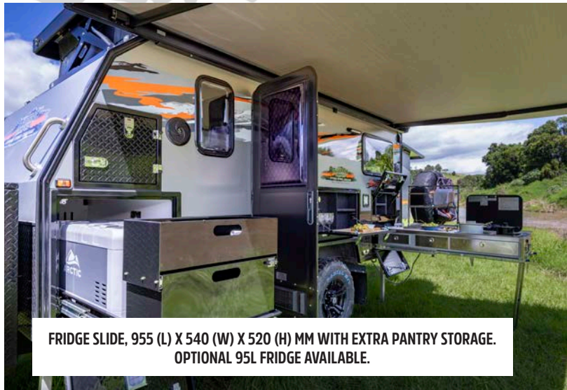
FRIDGE SLIDE, 955 (L) X 540 (W) X 520 (H) MM WITH EXTRA PANTRY STORAGE. OPTIONAL 95L FRIDGE AVAILABLE.