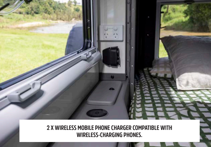
2 X WIRELESS MOBILE PHONE CHARGER COMPATIBLE WITH WIRELESS-CHARGING PHONES.