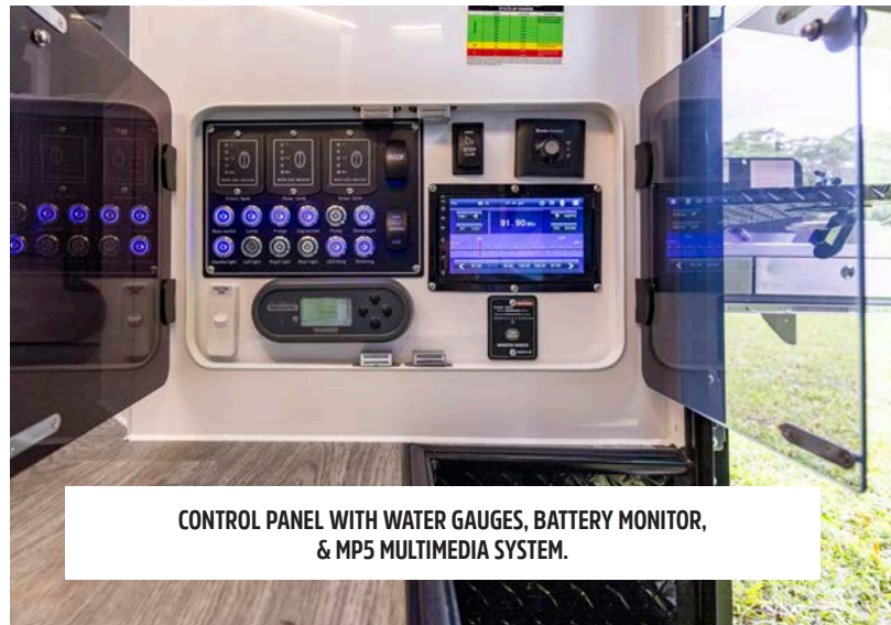
CONTROL PANEL WITH WATER GAUGES, BATTERY MONITOR, & MP5 MULTIMEDIA SYSTEM.