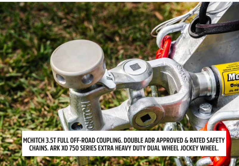
MCHITCH 3.5T FULL OFF-ROAD COUPLING. DOUBLE ADR APPROVED & RATED SAFETY CHAINS. ARK XO 750 SERIES EXTRA HEAVY DUTY DUAL WHEEL JOCKEY WHEEL.