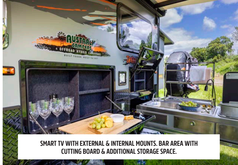
SMART TV WITH EXTERNAL & INTERNAL MOUNTS. BAR AREA WITH CUTTING BOARD & ADDITIONAL STORAGE SPACE.