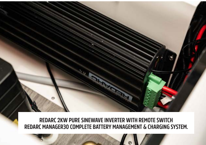
REDARC 2KW PURE SINEWAVE INVERTER WITH REMOTE SWITCH REDARC MANAGER30 COMPLETE BATTERY MANAGEMENT & CHARGING SYSTEM.