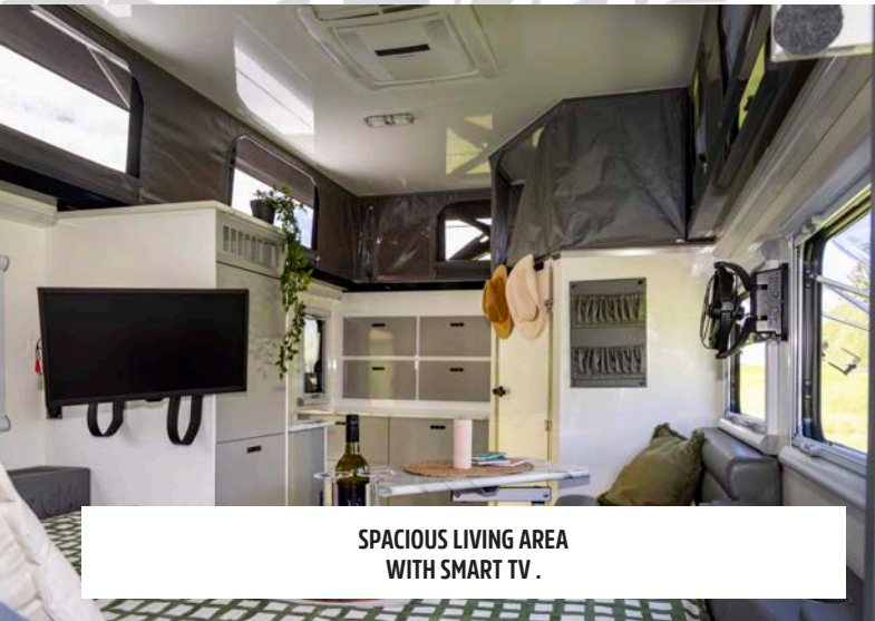
SPACIOUS LIVING AREA WITH SMART TV.