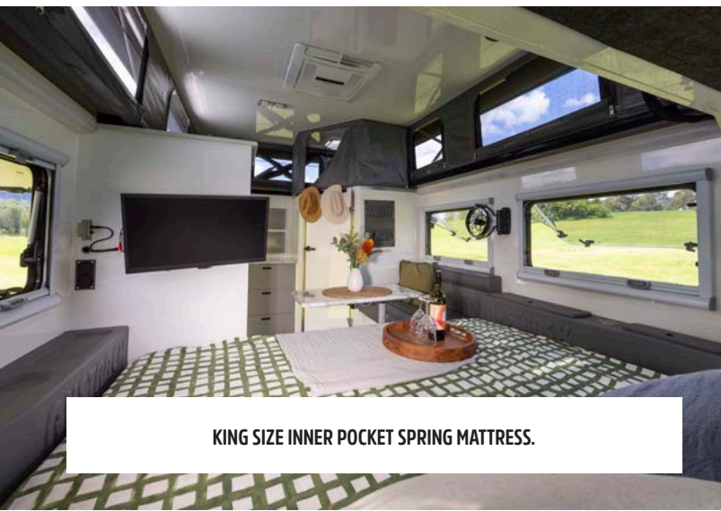
KING SIZE INNER POCKET SPRING MATTRESS.