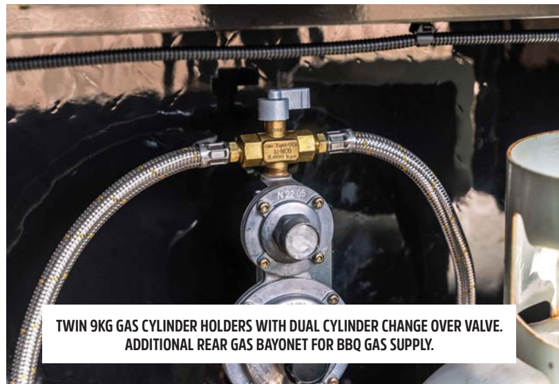
TWIN 9KG GAS CYLINDER HOLDERS WITH DUAL CYLINDER CHANGE OVER VALVE. ADDITIONAL REAR GAS BAYONET FOR BBQ GAS SUPPLY.