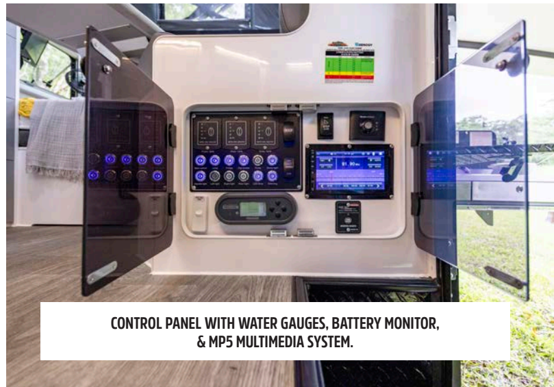
CONTROL PANEL WITH WATER GAUGES, BATTERY MONITOR, & MP5 MULTIMEDIA SYSTEM.