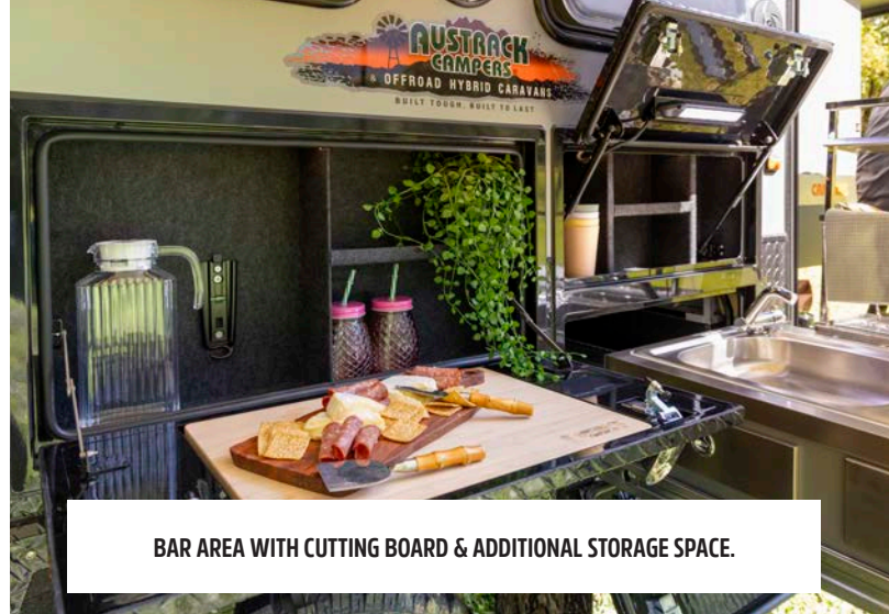
BAR AREA WITH CUTTING BOARD & ADDITIONAL STORAGE SPACE.