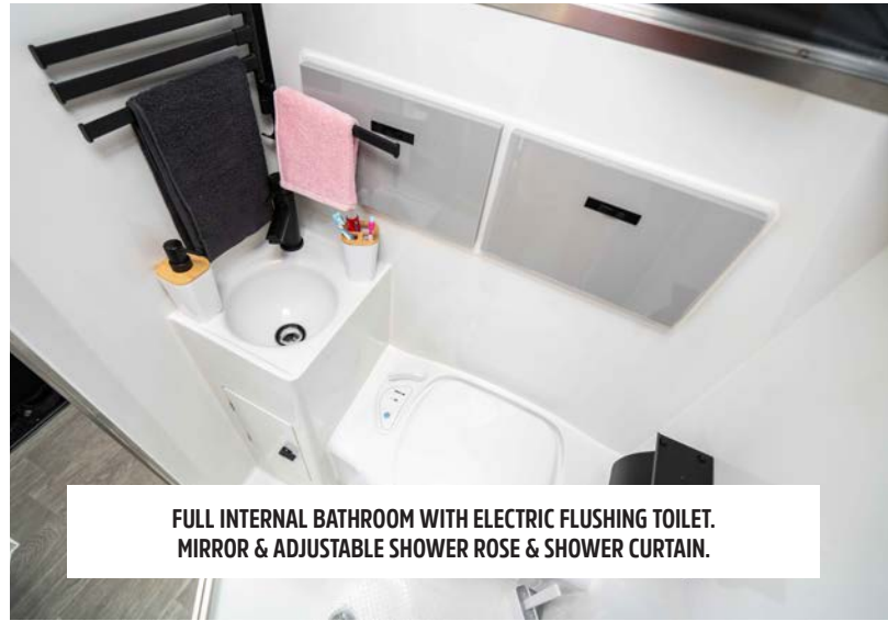
FULL INTERNAL BATHROOM WITH ELECTRIC FLUSHING TOILET. MIRROR & ADJUSTABLE SHOWER ROSE & SHOWER CURTAIN.