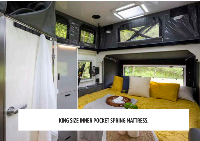
KING SIZE INNER POCKET SPRING MATTRESS.