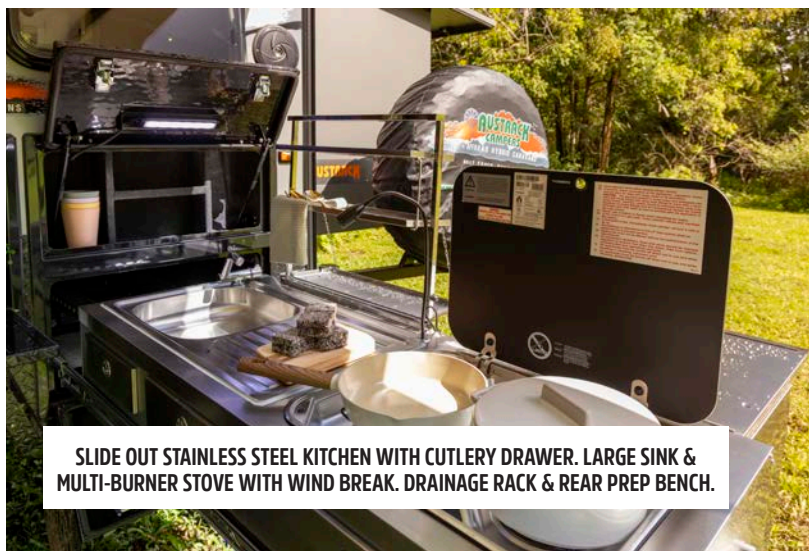
SLIDE OUT STAINLESS STEEL KITCHEN WITH CUTLERY DRAWER. LARGE SINK & MULTI-BURNER STOVE WITH WIND BREAK. DRAINAGE RACK & REAR PREP BENCH.