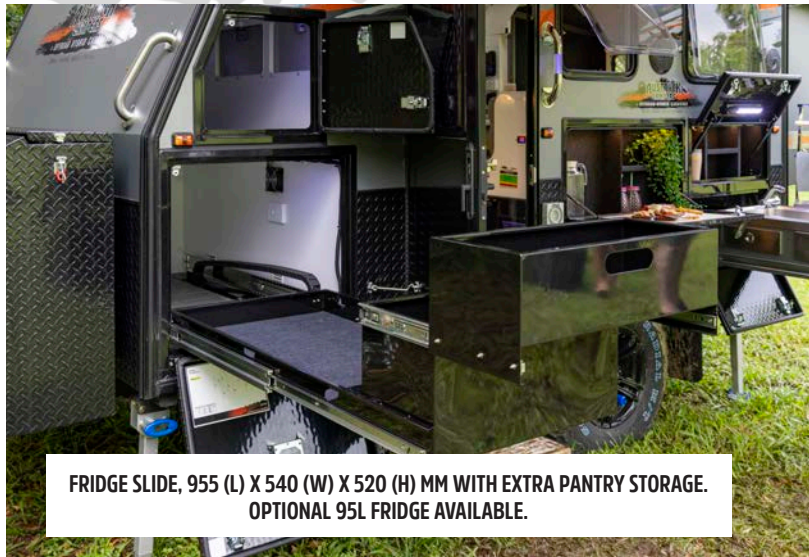
FRIDGE SLIDE, 955 (L) X 540 (W) X 520 (H) MM WITH EXTRA PANTRY STORAGE. OPTIONAL 95L FRIDGE AVAILABLE.