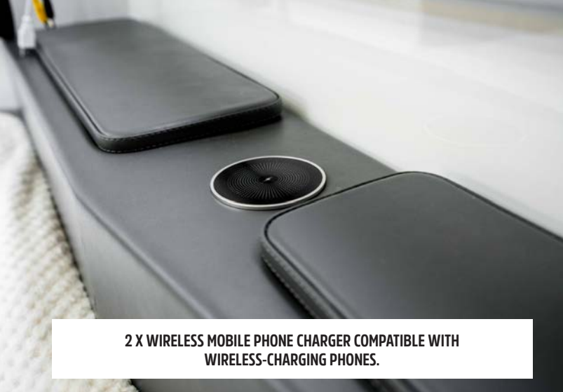
2 X WIRELESS MOBILE PHONE CHARGER COMPATIBLE WITH WIRELESS-CHARGING PHONES.