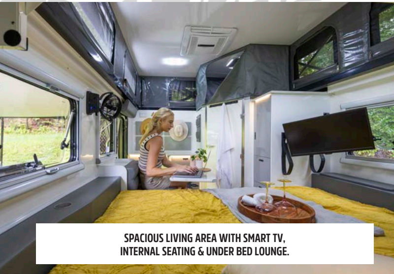
SPACIOUS LIVING AREA WITH SMART TV, INTERNAL SEATING & UNDER BED LOUNGE.