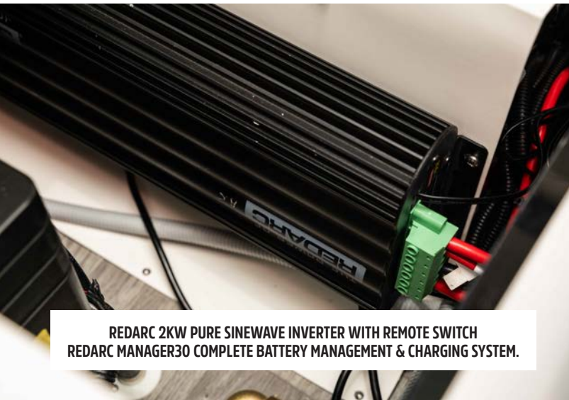
REDARC 2KW PURE SINEWAVE INVERTER WITH REMOTE SWITCH REDARC MANAGER30 COMPLETE BATTERY MANAGEMENT & CHARGING SYSTEM.